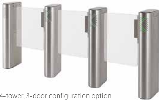
4-tower, 3-door configuration option